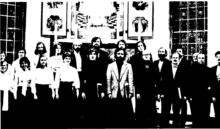
Cappella Nova, winners of the Society's first Noah Greenberg Award. Director Richard Taruskin stands in back row, center.