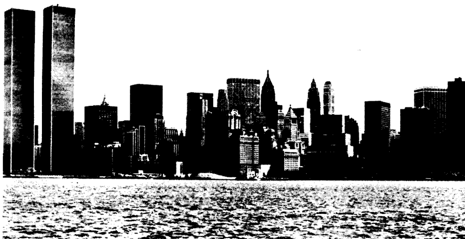
Skyline of Lower Manhattan

Opera will also be one of the "extracurricular" attractions in New York. On Wednesday October 31st at 8 P.M. there will be