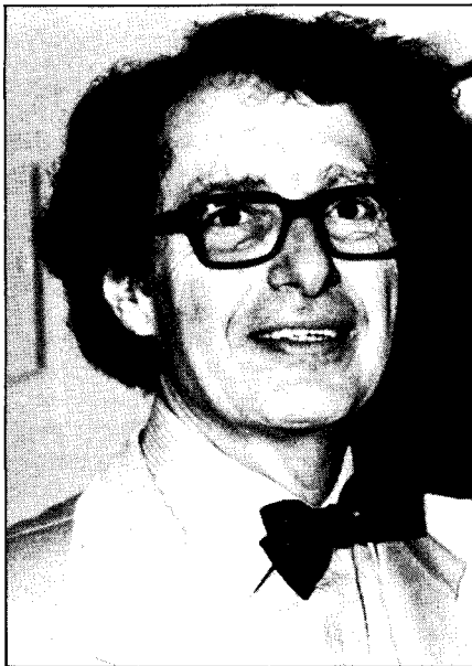
Honorary Member Leonard B. Meyer