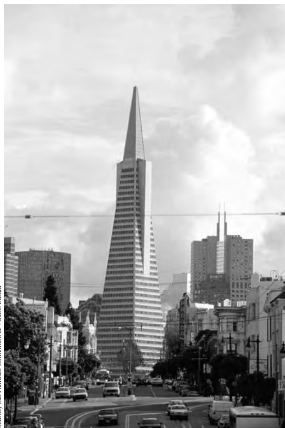
The TransAmerica Building, San Francisco

list.bowdoin.edu/pipermail/ams-announce/2010-December/002446.html