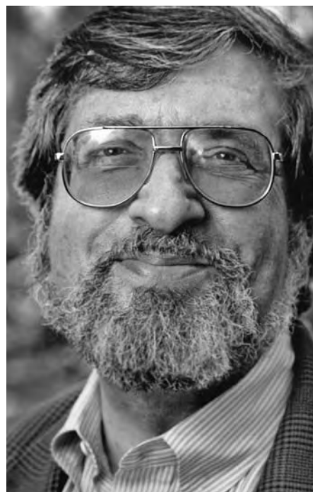
Richard Taruskin Honorary Member

Richard Taruskin is the Class of 1955 Professor of Music at the University of California, Berkeley. He received his B.A. in music (1965), M.A. (1968), and Ph.D. (1975) in historical musicology from Columbia University, where he taught from 1976 to 1987. While at Columbia, he served as director of the Collegium Musicum and the Cappella Nova, and performed as viol soloist with the Aulos Ensemble. He recorded over fifteen discs with these groups, and from 1978 to 1983 he edited