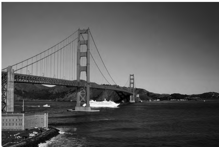
The Golden Gate Bridge, San Francisco