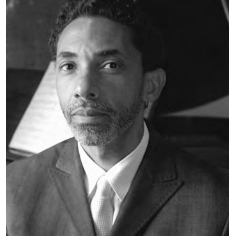
Robin D. G. Kelley MAC Award Winner