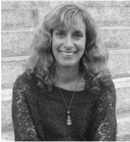
Susan Thomas Stevenson Award Winner