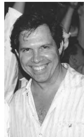
Thomas Brothers AMS / Library of Congress Lecturer

The Communications Committee welcomes proposals from AMS members interested in giving a lecture as part of this distinguished series, which is intended to showcase research conducted using the extraordinary resources of the Library of Congress Music Division. All lectures are available as webcasts. Links to the webcasts and application information can be found at www.ams-net.org/LC-lectures . The application deadline for the Fall 2013–Spring 2014 series is 1 December 2012.