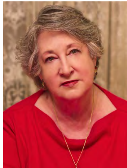
Laura Youens Palisca Award Winner