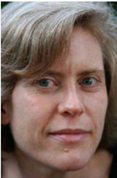
Susan Boynton Stevenson Award Winner